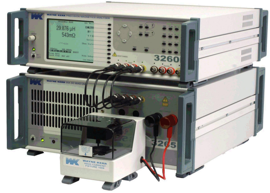
SMD inductors can be tested with DC bias currents up to 50A by using the High Current Fixture accessory with the 3260B Precision Magnetics Analyzer with either one or two 3265B DC Bias Units

Interchangeable component test carriers ensures that the 1009 test fixture may be used with a wide variety of different devices. Order part number 1J1009